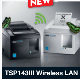
TSP143III Wireless LAN