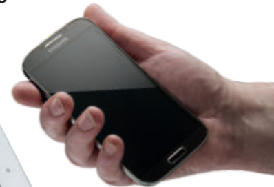
Tablet and phone not included

"Use your own tablet, smartphone or laptop and payment device"